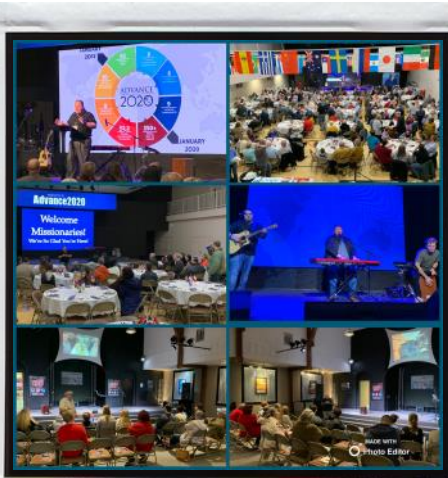
This year's Advance 2020 Missions Conference was the best yet! Thanks to all who joined us January 24th-26th.