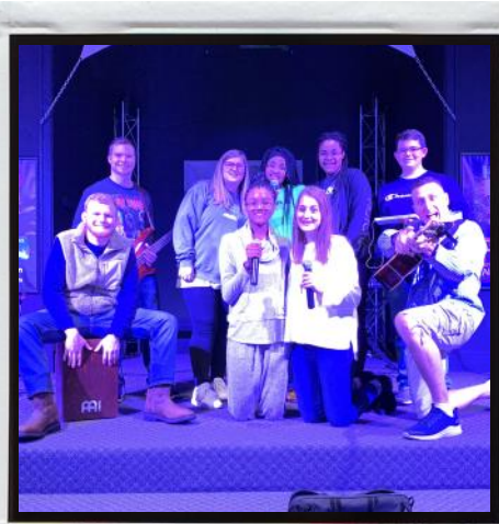
We sure do appreciate our Wednesday night student worship team, and how they lead us so well each week.